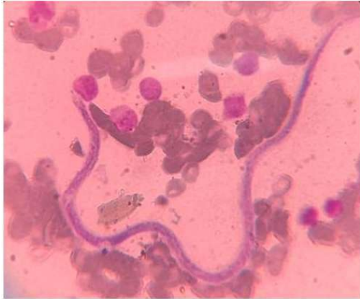
Fig. 1: Peripheral blood smear showing sheathed microfilariae with nuclei not reaching upto tail tip, suggesting it to be wuchereria bancrofti. Many blasts are seen adjacent to it (Leishman staining 100X)